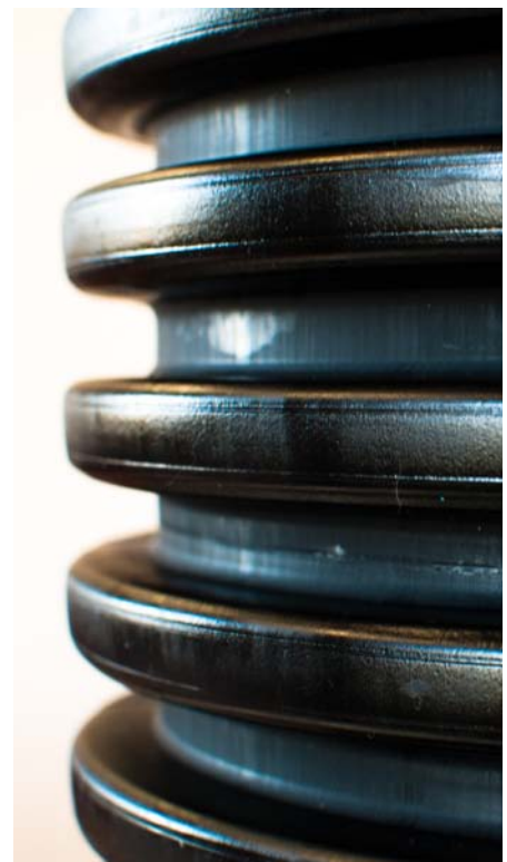
BOSS 2000 - DETAIL OF 300MM