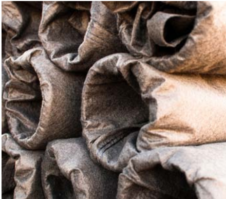
BOSS 2000 - 150MM WITH GEO SOCK