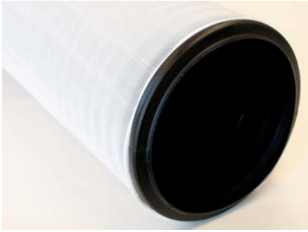
BOSS 2000 - 200MM WITH FILTER SOCK