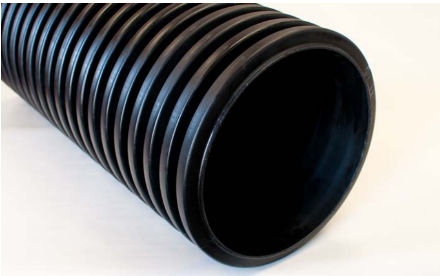
BOSS 2000 - 250MM