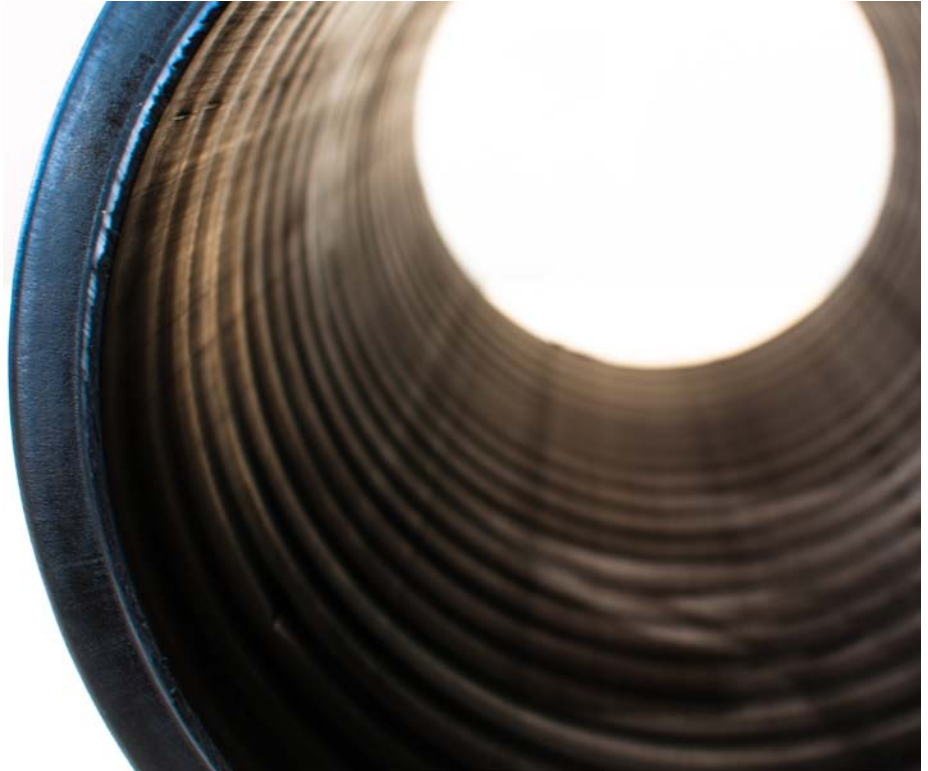
BOSS 2000 - DETAIL OF 300MM