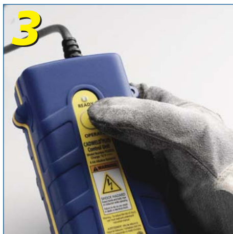
Press and hold control unit switch and wait for the ignition