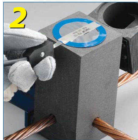
Attach control unit termination clip to ignition strip