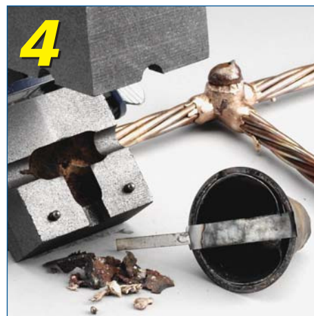
Open the mold and remove the expended steel cup – no special disposal required

CADWELD PLUS Control Unit initiates the reaction of the metal crucible. The standard unit includes a 6-foot (1.8 meter) high temperature control unit lead. The lead attaches to the ignition strip using a custom made, purpose-designed termination clip.