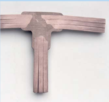
The CADWELD molecular bond will last the lifetime of the conductors.