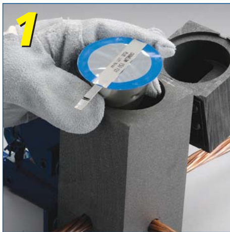
Insert CADWELD PLUS package into mold (may require use of a cover/baffle)